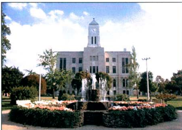
Erie County Juvenile Court 323 Columbus Avenue Sandusky, Ohio 44870